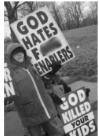
Westboro Members Protesting at a Funeral

This fact was never more evident to me than this last year. I had the opportunity to visit several different churches through the course of the year. Some were large. Some were small. Even in the small churches, whether in the center of the city or in a remote area, I still ran across people affected by homosexuality. Do we extend hope to those affected or do we remain silent, hoping the problem will go away or not reveal itself?