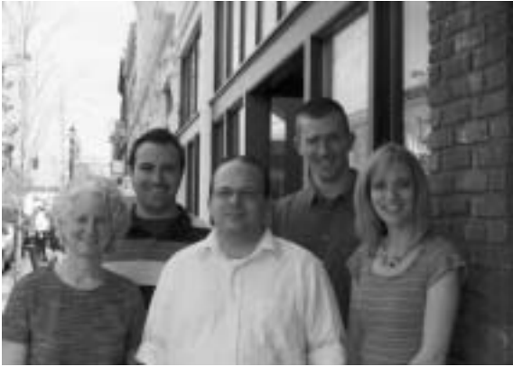
Mid-Valley Fellowship Board of Directors